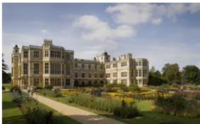
A view of Audley End

Ring Cherry McAskill on 0208 888 7856 to book a place. Visit the Audley End website at: http://www.englishheritage.org.uk/daysout/properties/audley-end-house-and-gardens/