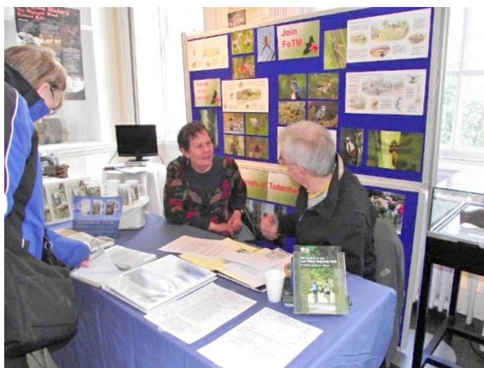
The Friends of Tottenham Marshes stall

Each gallery had stalls to wander round with different takes on local history and related subjects from pen and ink drawings of historical buildings, books, leaflets and information of just about anything or anyone from the past one may wish to investigate.