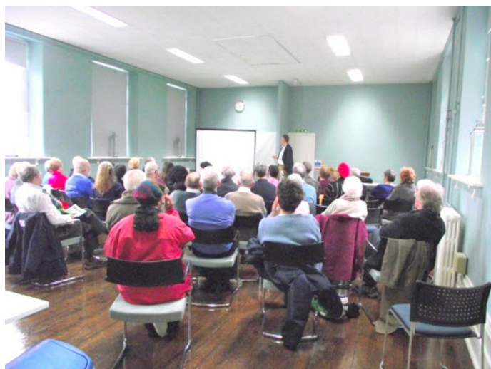
A captivated audience at one of the talks

The Local History Fair was held in February this year at the museum. It was the first one I'd been to for a few years and it seemed to be much busier than the last one I'd attended. The lecture Hall seemed to be packed at each talk given by some interesting and varied speakers.